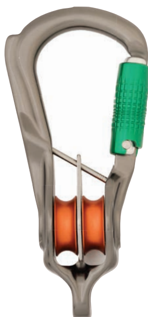
› Revolver Rig Twin