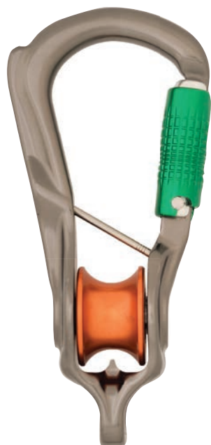
› Revolver Rig